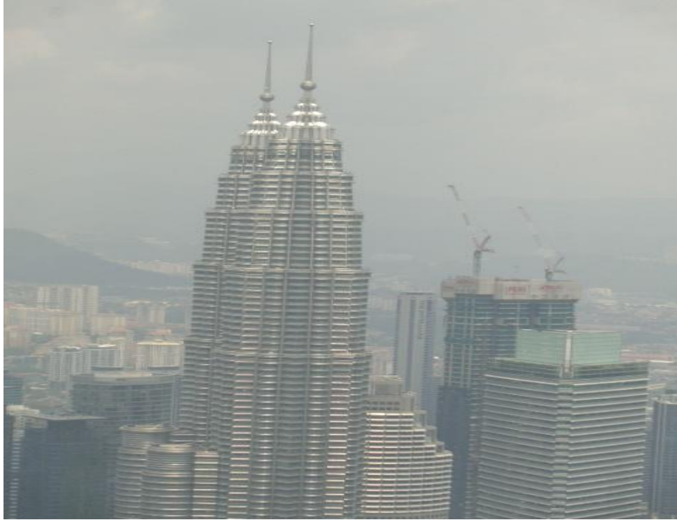
Sky view of KL Tower (420 m)