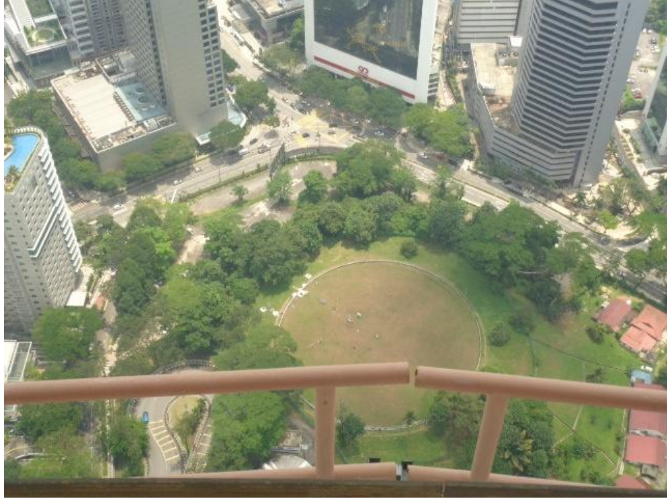
Revolving Restaurant @ KL Tower