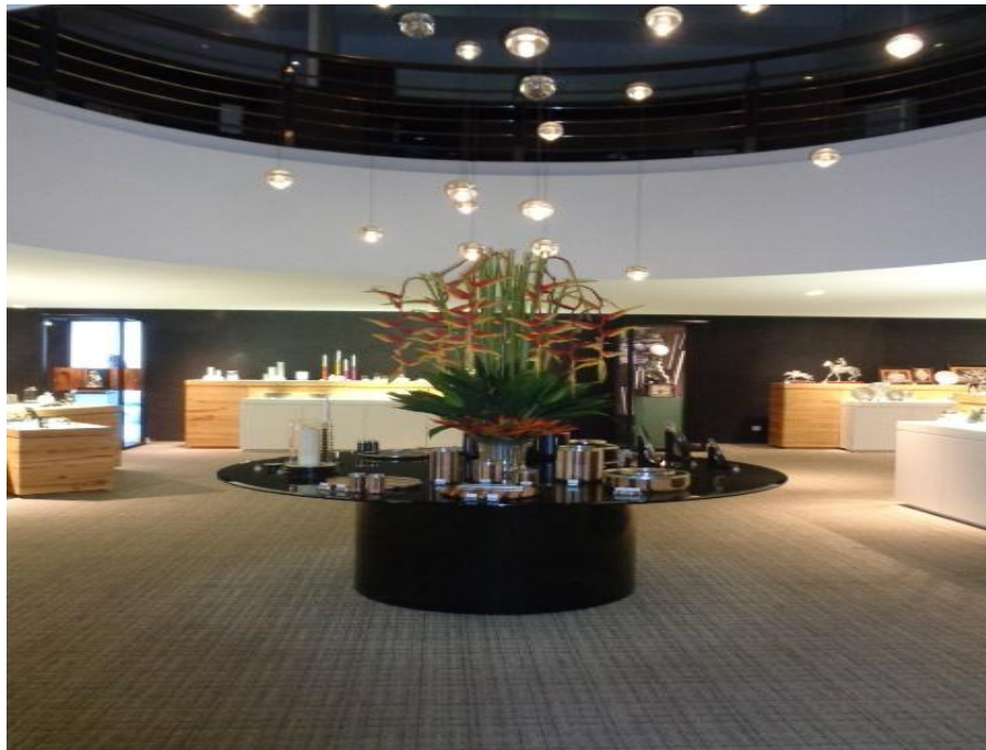
Unique Building @ KL