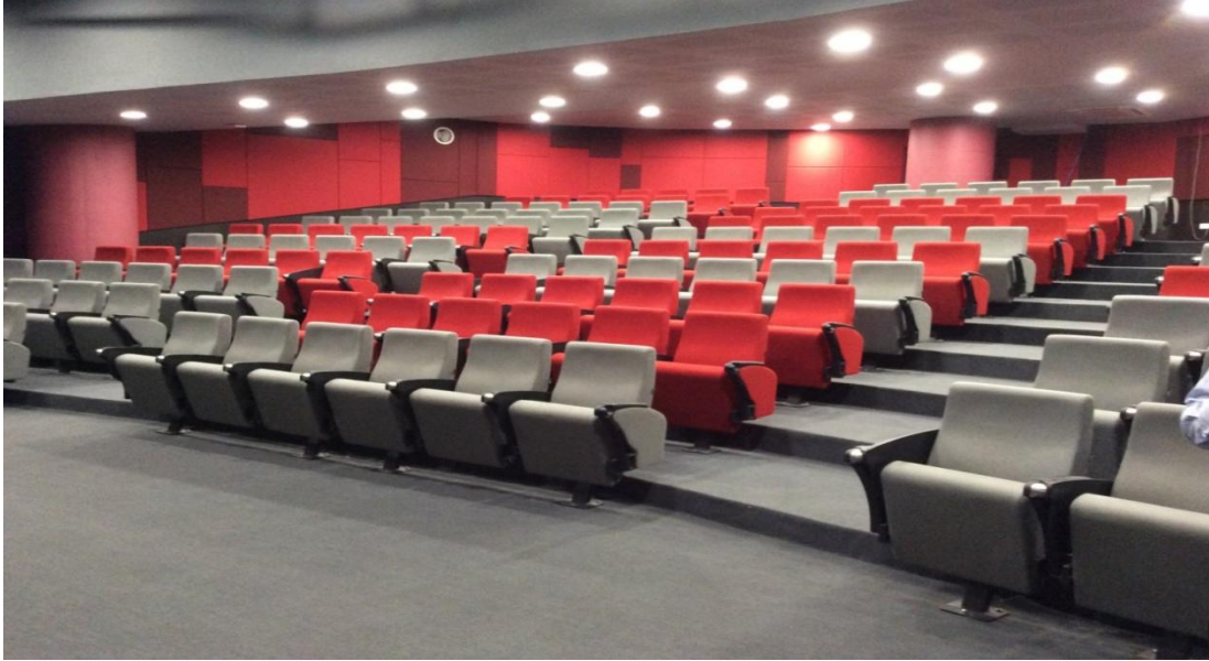
Students Interaction with Mr.Arun