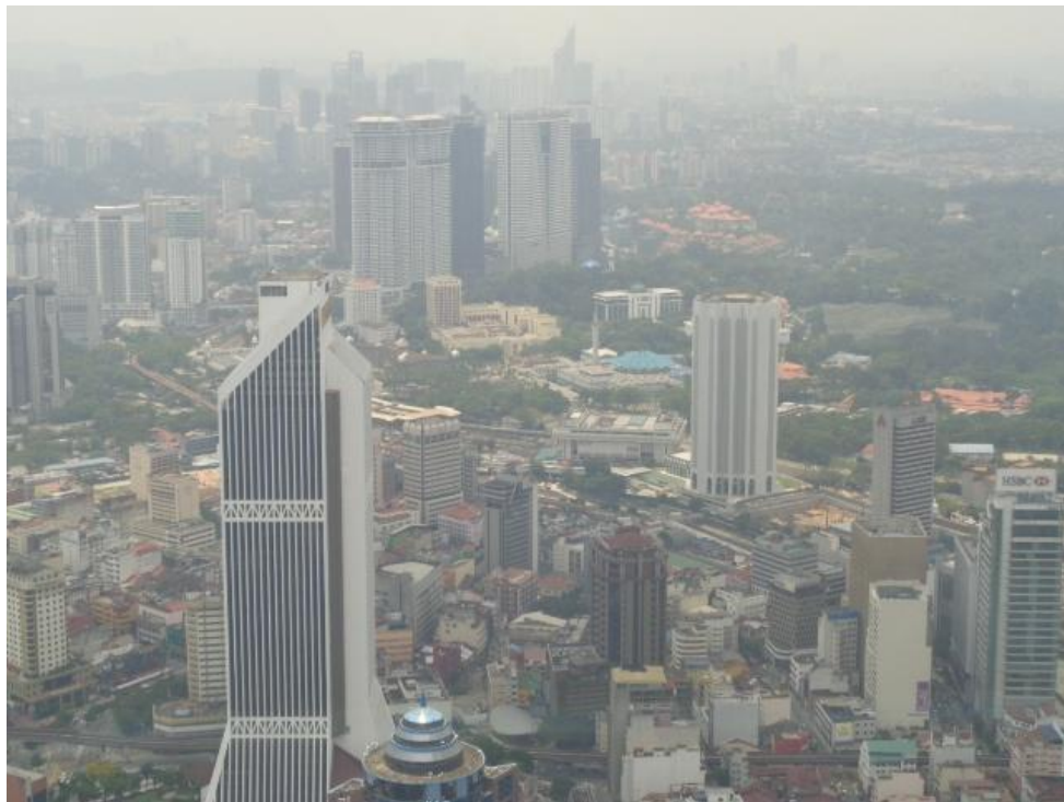
Aerial view from KL tower