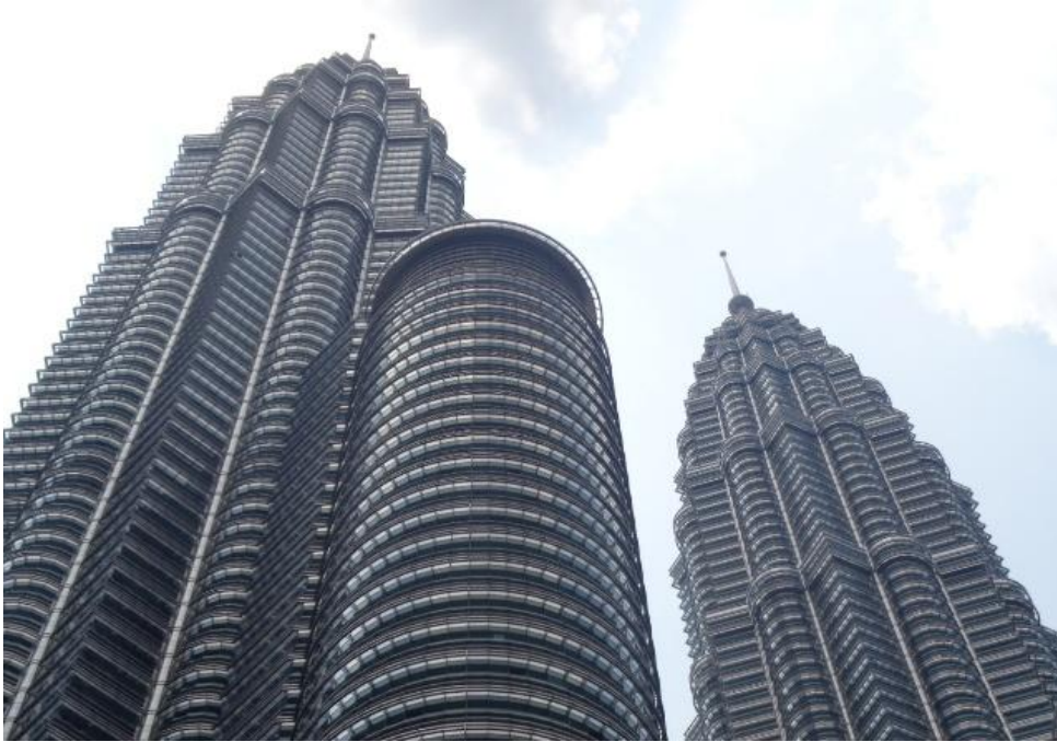
Revolving Restaurant at KL tower