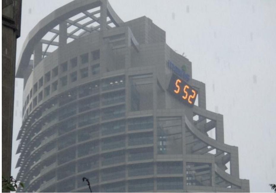
City view from KL tower