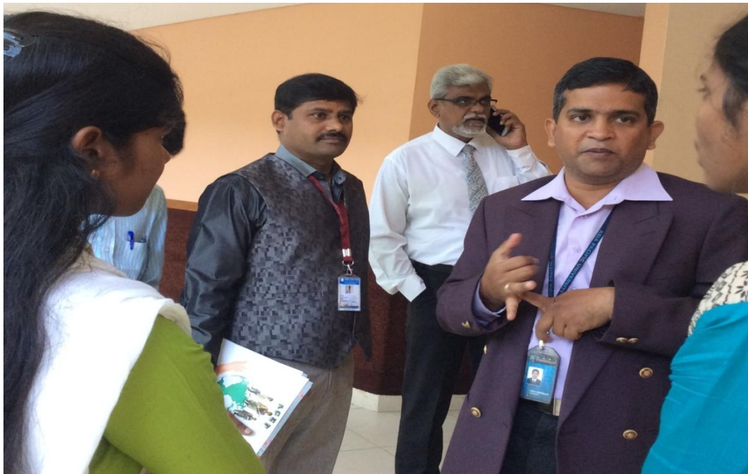
News & Hot Gallery at Library