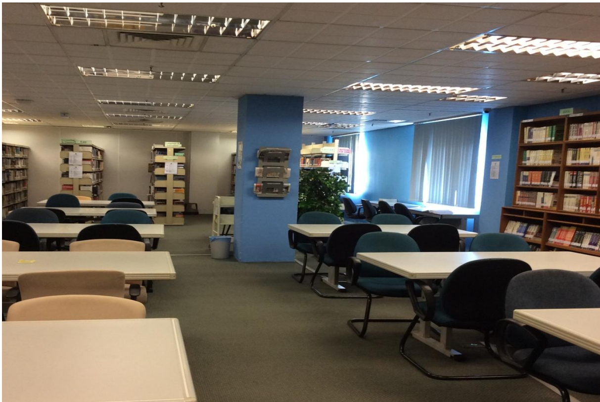
Library at APU University