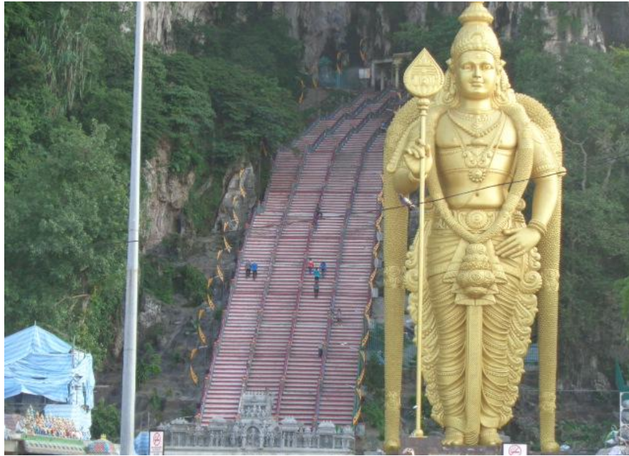
Selangor Pewter gift gallery